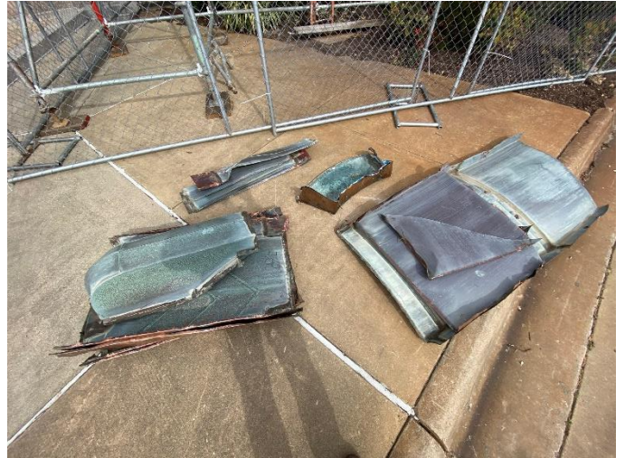
Photo02: Removed Copper Cladding