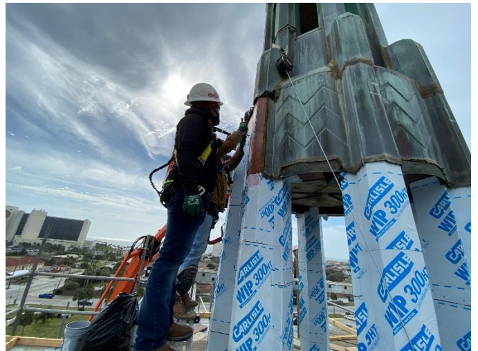
Photo04: Waterproof Membrane Applied on Next Tier