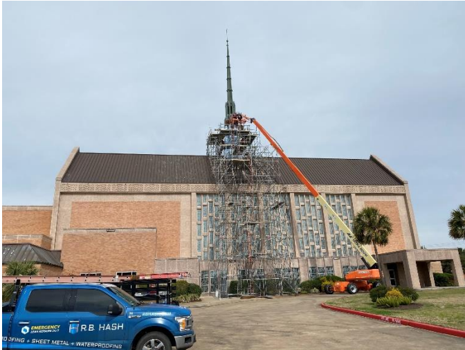
Photo01: Overview of Work in Progress