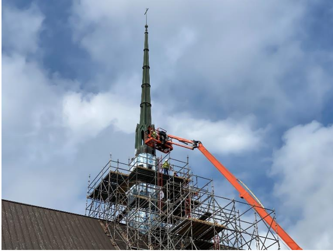
Photo08: Overview of Work in Progress