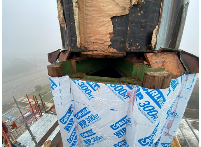
Photo06: More Copper is Removed