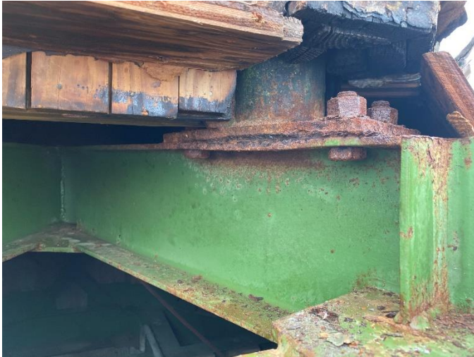
Photo05: Steel Beams Beneath the Copper Cladding