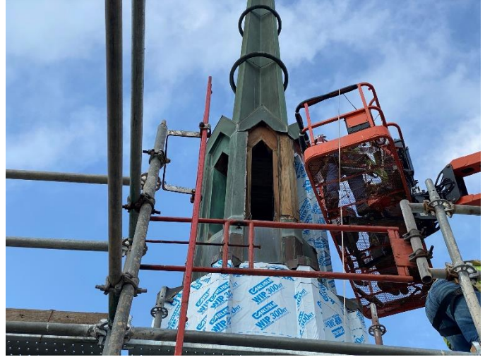
Photo09: Copper Cladding Removed from Upper Level of Steeple