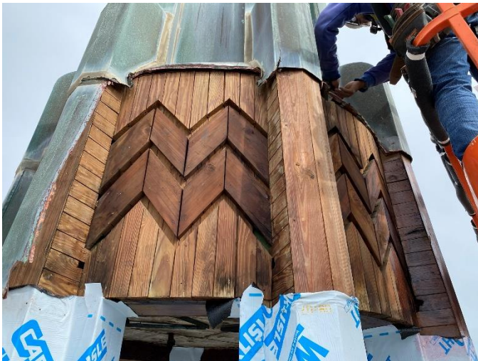
Photo03: Exposed Wood Underneath Copper Cladding