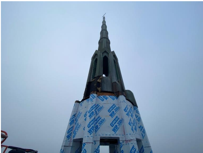
Photo07: Overview of Work in Progress